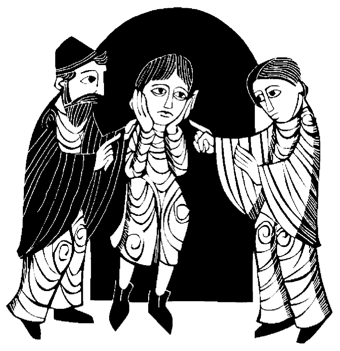
"No servant can serve two masters." Luke 16:13