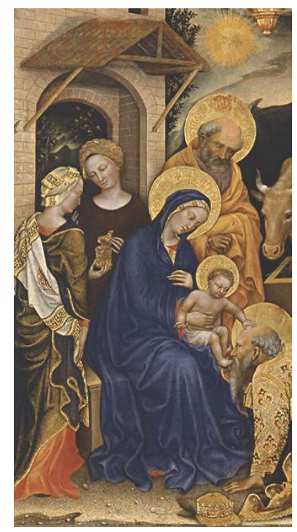
Adoration of the Magi (detail) Gentil de Fabriano, 1423