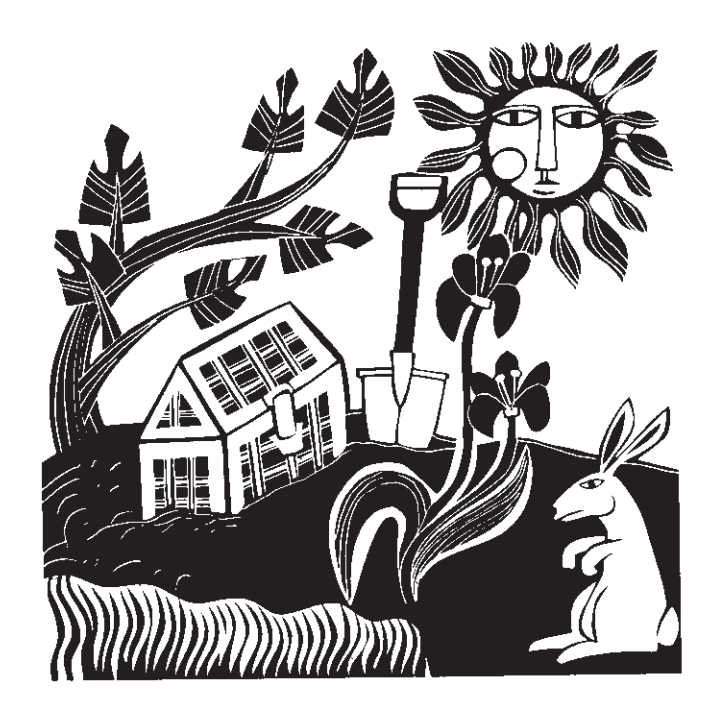
"The kingdom of heaven is like a treasure buried in the field." Matthew 13:23