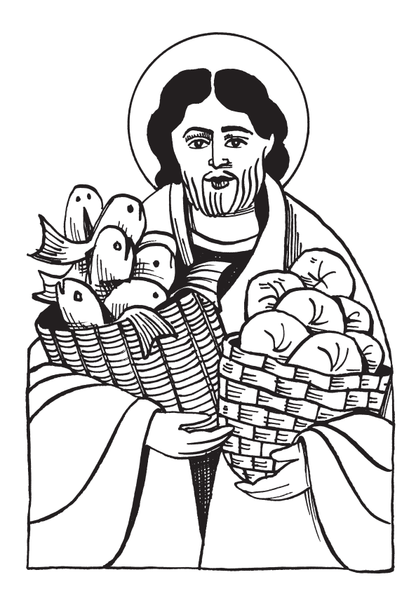
They all ate and were satisfied, and they picked up the fragments left over—twelve wicker baskets full. Matthew 14:20

The Eighteenth Sunday in Ordinary Time # August 2, 2020