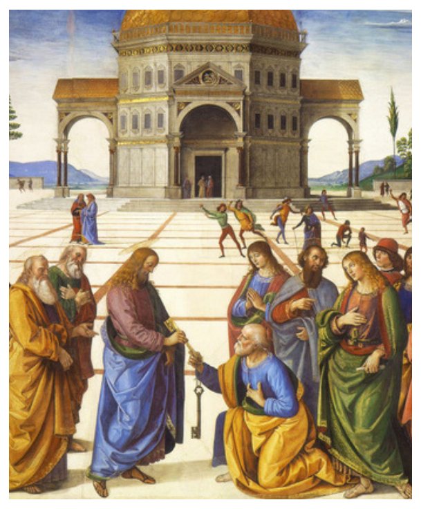
Christ gives the keys of the kingdom to Peter, detail Perugino, (1481/1482)