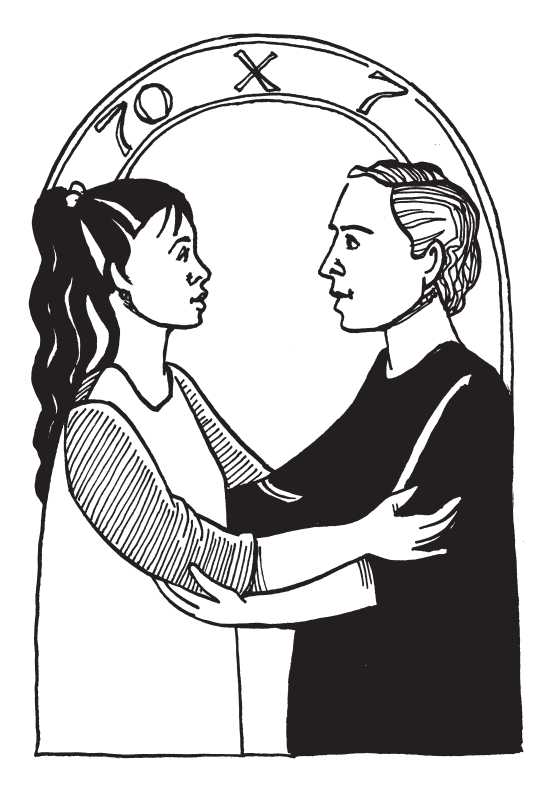
"I say to you, forgive not seven times, but seventy-seven times." Matthew 18:22