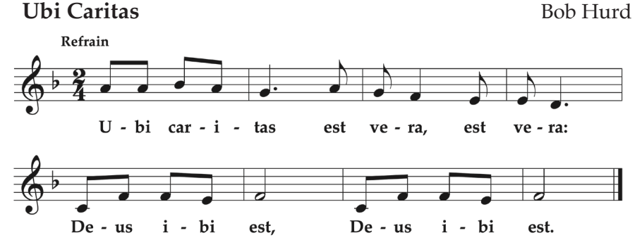
Where there is true charity, God is present.