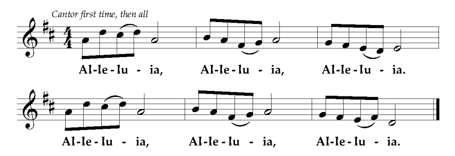
Come to me, all you who labor and are burdened, and I will give you rest, says the Lord.