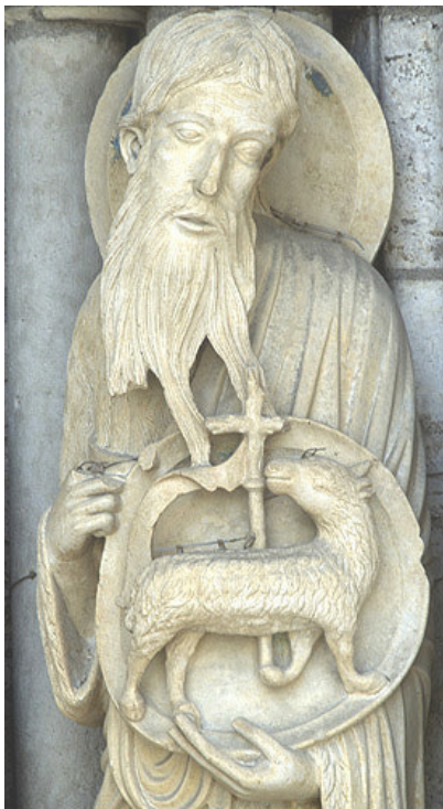
John the Baptist Chartres Cathedral (France) 13 th cent.