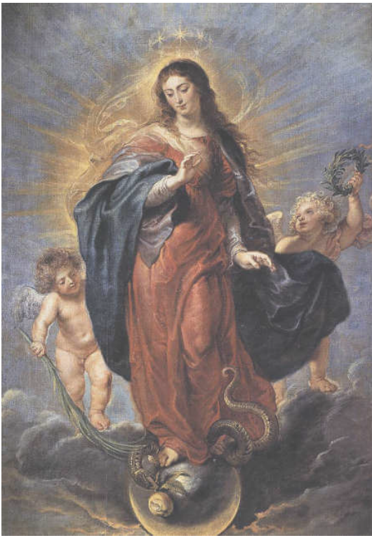
Immaculate Conception (c. 1628) Peter Paul Rubens (1577-1640)