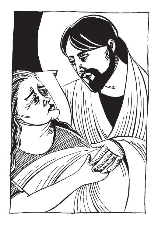
Jesus heals Simon's mother-in-law. Mark 1:31