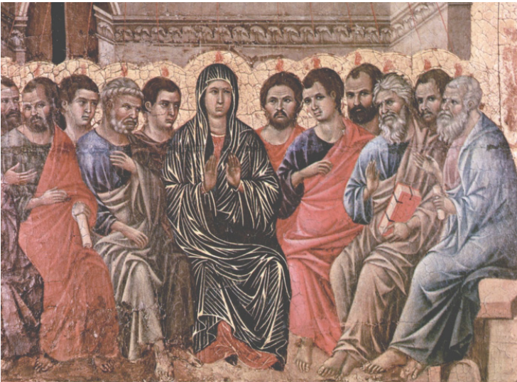
Pentecost , Panel from the Maesta Altarpiece of Siena, Duccio di Buoninsegna (1308-1311)