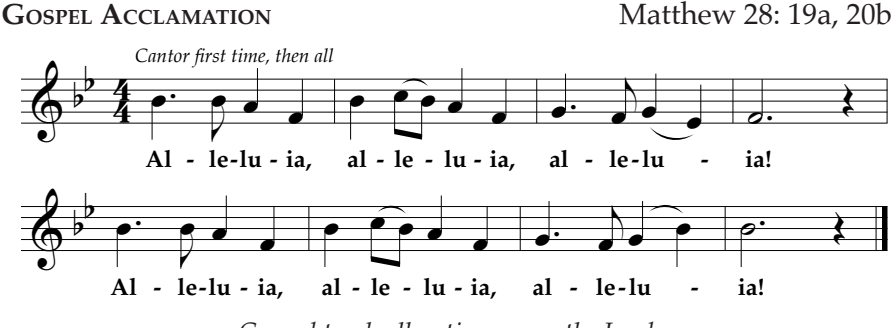
Go and teach all nations, says the Lord; I am with you always, until the end of the world.