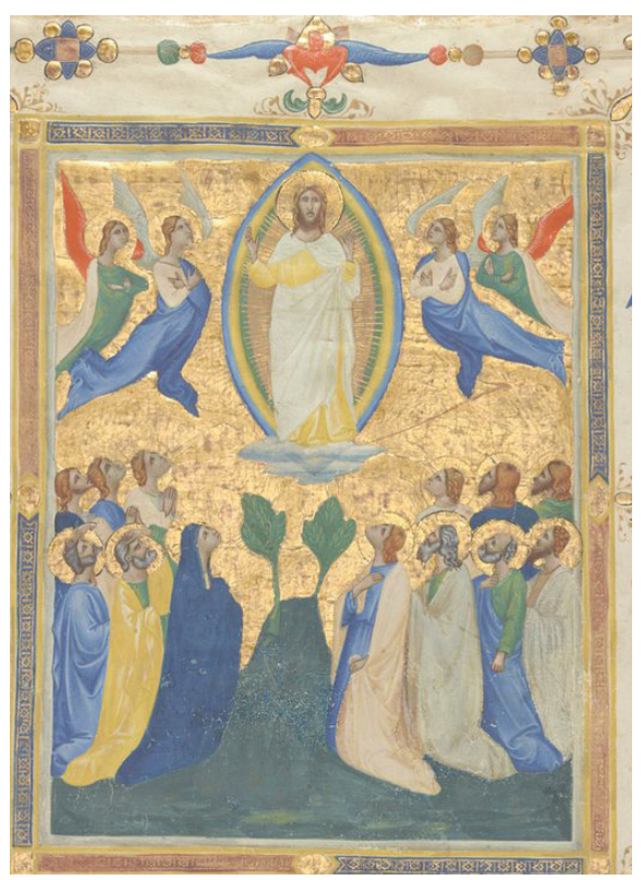
The Ascension of Christ Laudario of Sant'Agnese, Pacino di Bonaguida, c. 1340