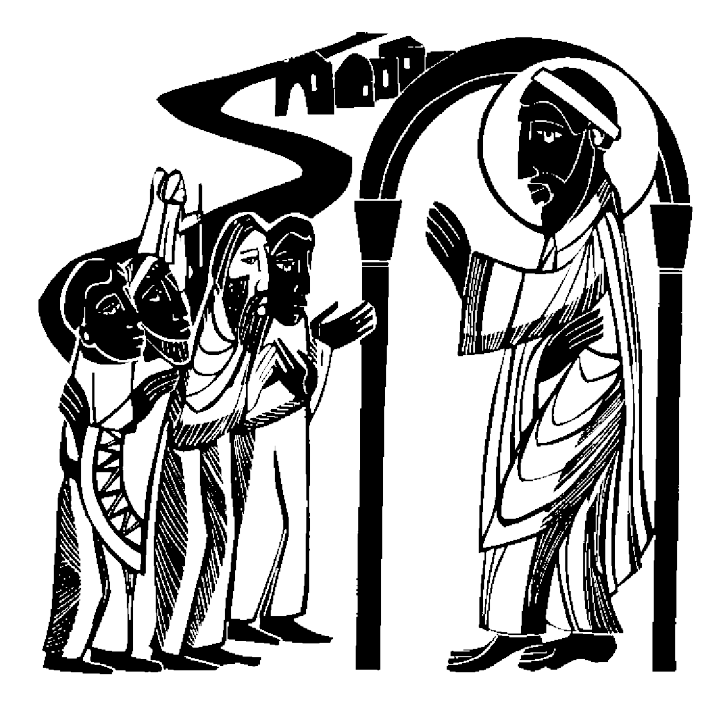
"And he began to send them out two by two." Mark 6:7