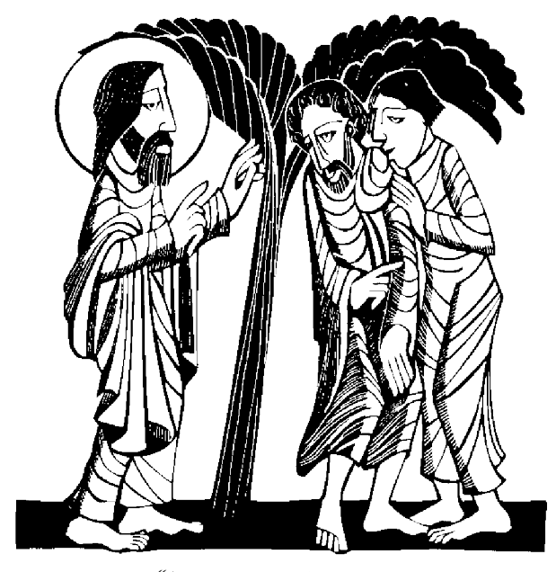
"Amen, amen, I say to you, whoever believes has eternal life." John 6:35