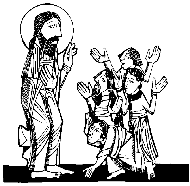
"Master, to whom shall we go? You have the words of everlasting life." John 6:68