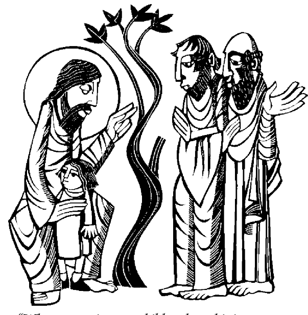
"Whoever receives one child such as this in my name, receives me; and whoever receives me, receives not me but the One who sent me." Mark 9:37