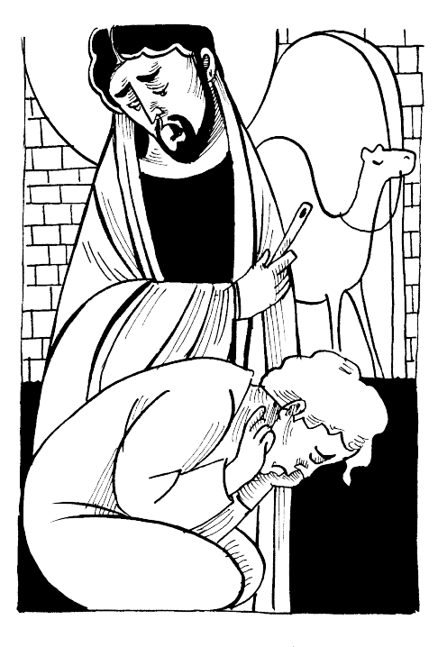
"For human beings it is impossible, but not for God. All things are possible for God." Mark 10:27