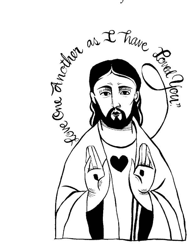
FIFTH SUNDAY OF EASTER