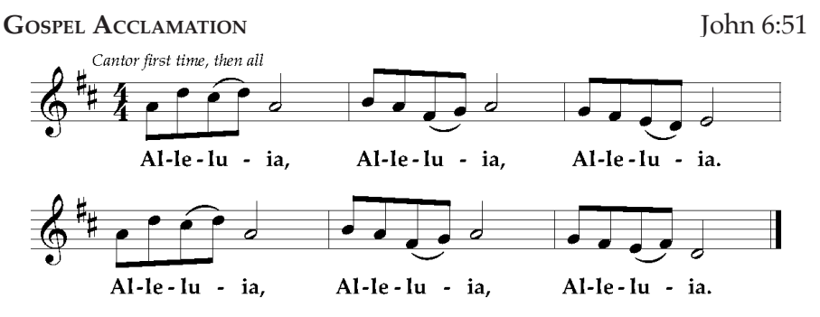
I am the living bread that came down from heaven, says the Lord; whoever eats this bread will live forever.

For as often as you eat and drink, you proclaim the death of the Lord.