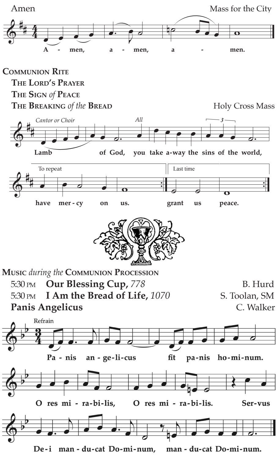
The Bread of Angels becomes bread for humankind. A miraculous thing! The servant of God eats of the Lord.