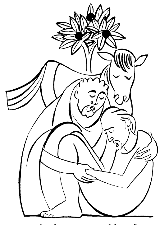
"Who is my neighbor?" Luke 10:29