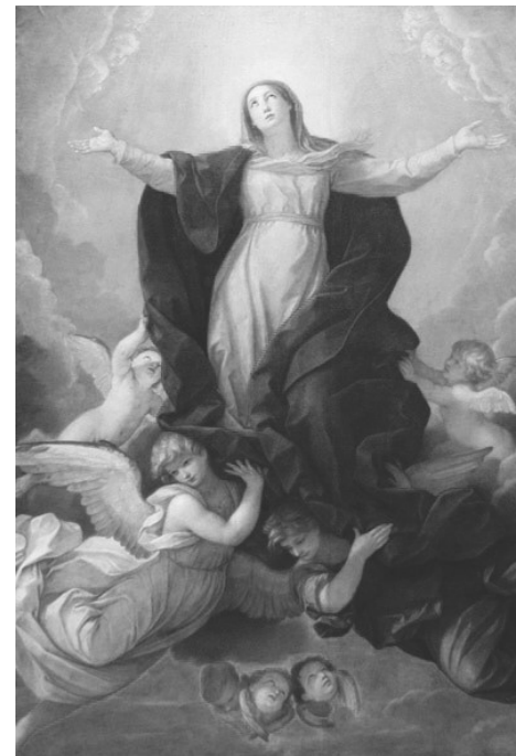
The Ascension of the Virgin Guido Reni (1642)