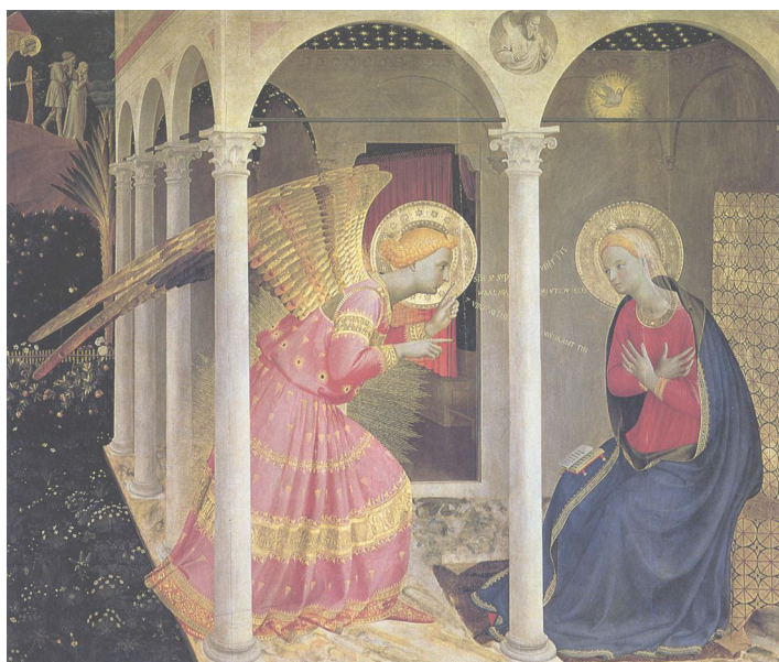
The Annunciation, Fra Angelico (1433-34)