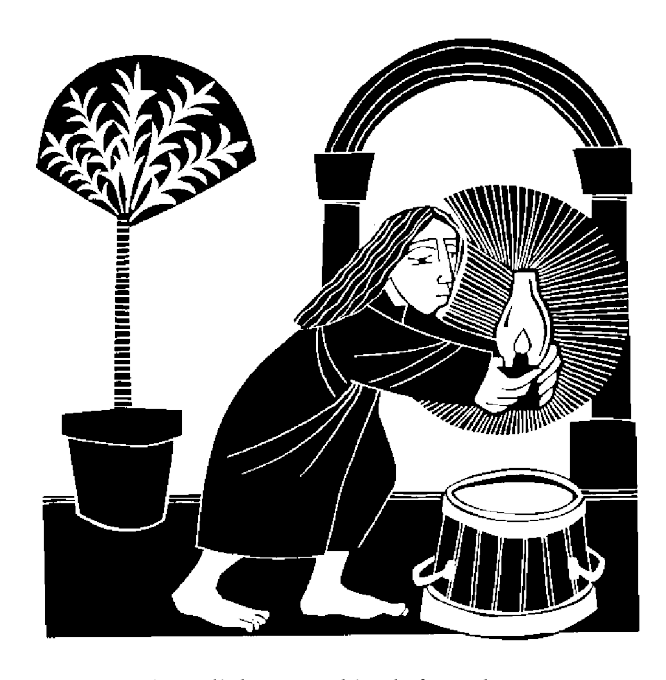
Your light must shine before others. Matthew 5:16