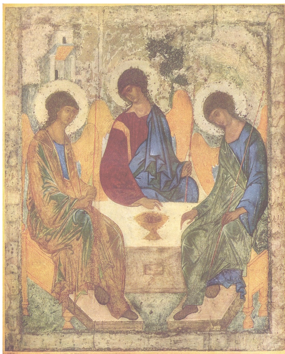
Holy Trinity Icon, 1400 St. Andrei Rublev