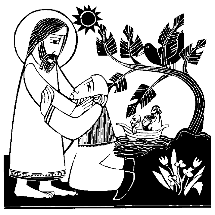
"You are the Christ, the Son of the living God." Matthew 16:16