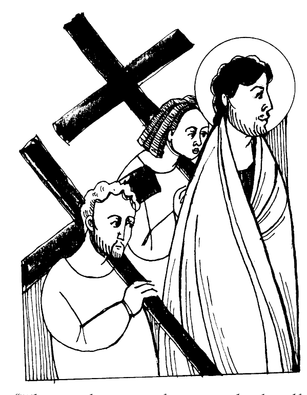
"Whoever wishes to come after me must deny himself, take up his cross, and follow me." Matthew 16:24