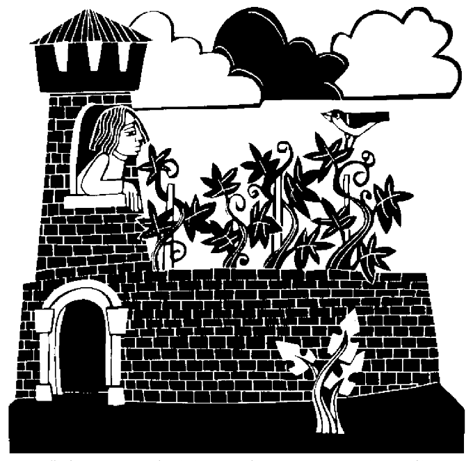
"The vineyard of the Lord is the house of Israel." Psalm 80:9