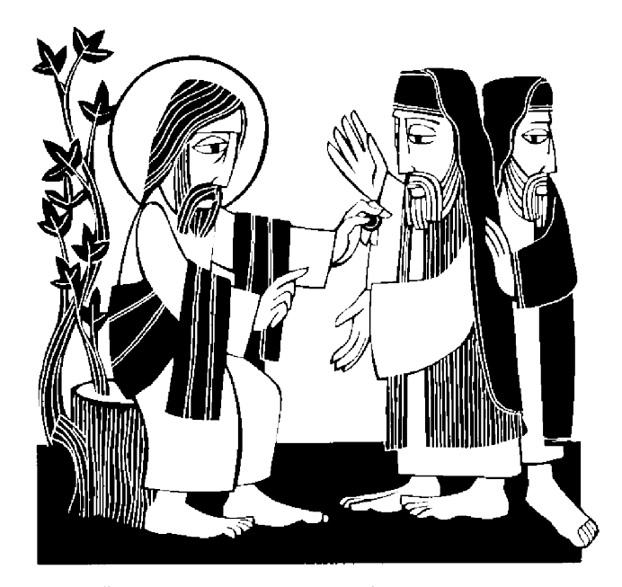
"Repay to Caesar what belongs to Caesar and to God what belongs to God." Matthew 22:21