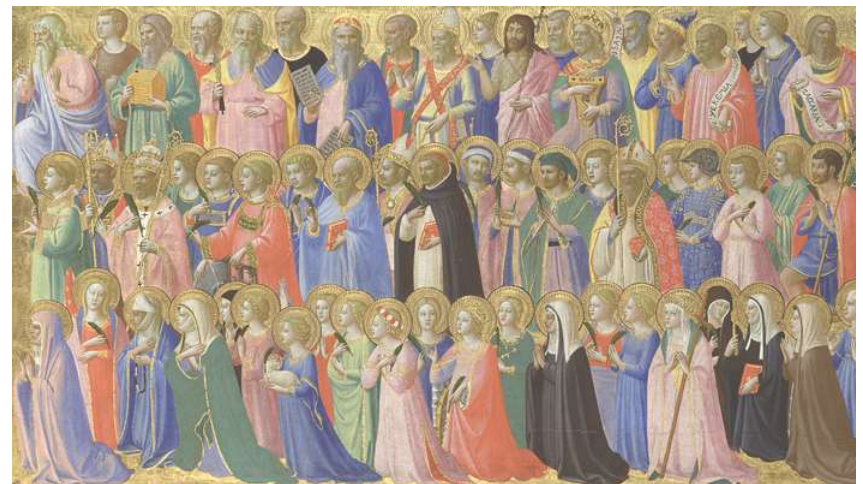
Forerunners of Christ with Saints and Martyrs Fra Angelico (1423-1424)