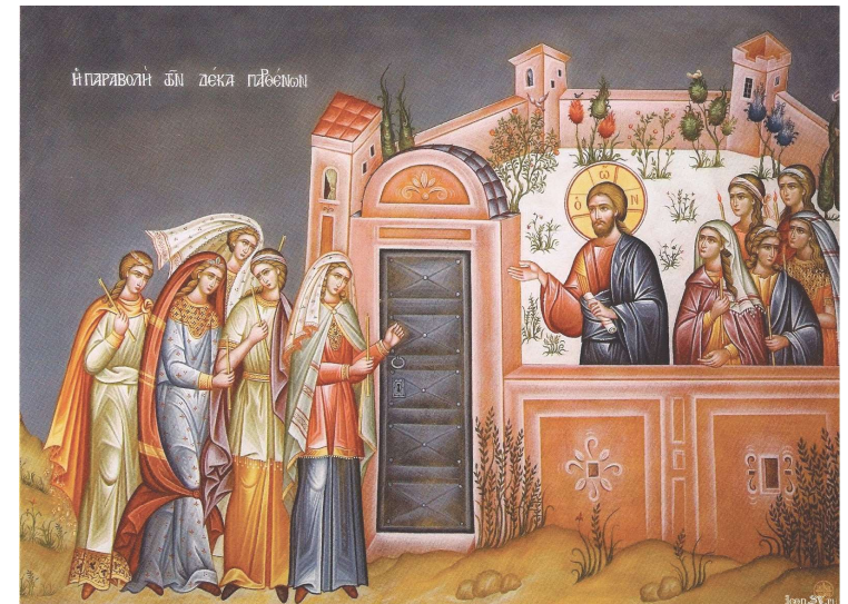
Parable of the Five Wise Virgins, Greek Icon