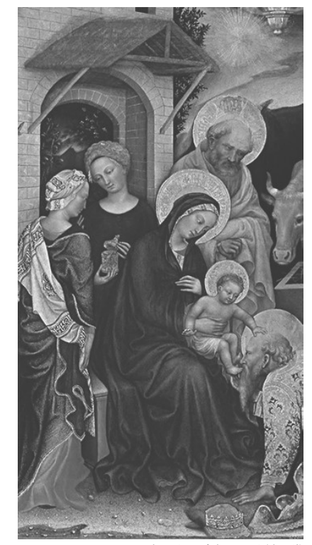
Adoration of the Magi (detail) Gentil de Fabriano, 1423