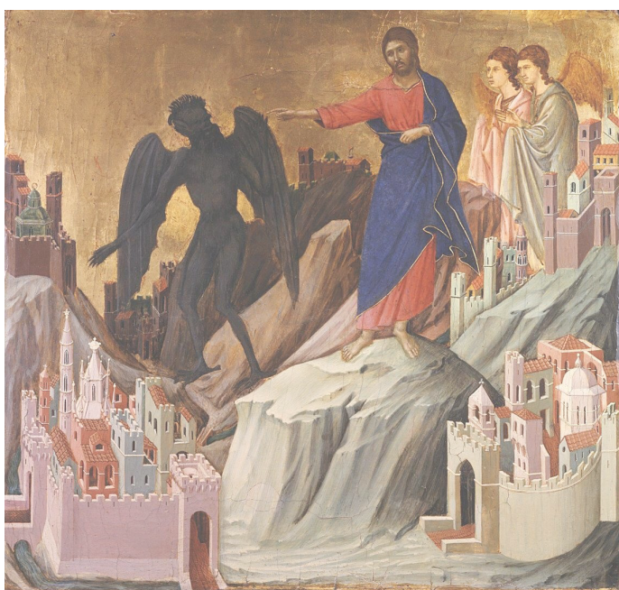
The Temptation on the Mount Duccio (1308-1311)