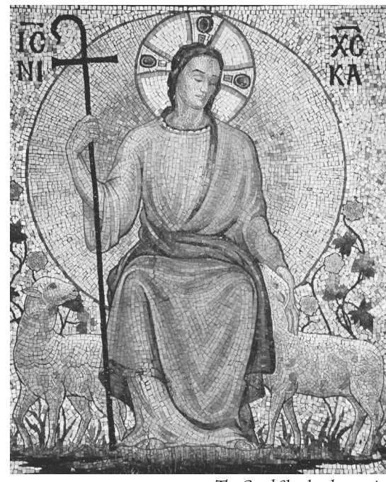
The Good Shepherd, mosaic, Basilica of the National Shrine of the Immaculate Conception, Washington, DC