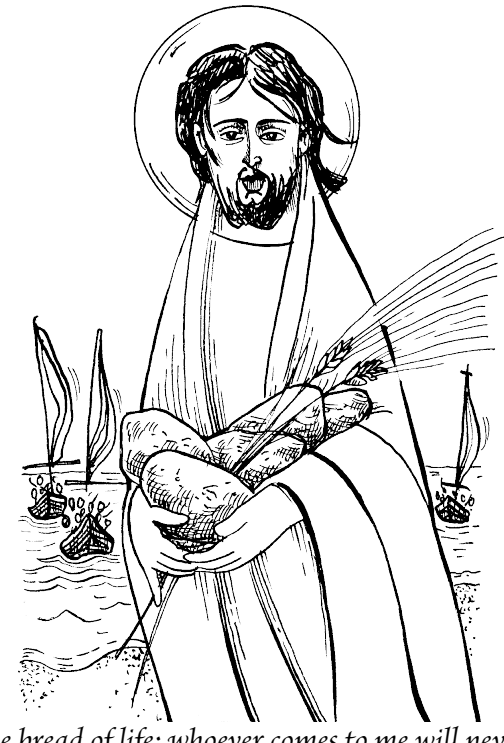
"I am the bread of life; whoever comes to me will never hunger, and whoever believes in me will never thirst." John 6:35