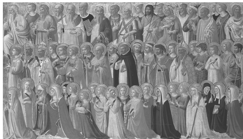
Forerunners of Christ with Saints and Martyrs Fra Angelico (1423-1424)