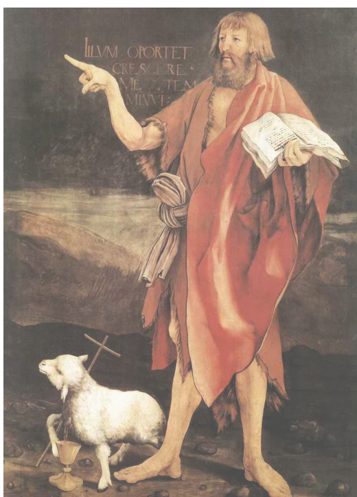
John the Baptist (1510-1515) from the Isenheim Altarpiece Matthias Grünewald (ca. 1480 – 1528)