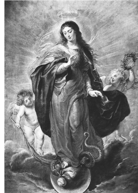
The Immaculate Conception (c. 1628) Peter Paul Rubens (1577-1640)