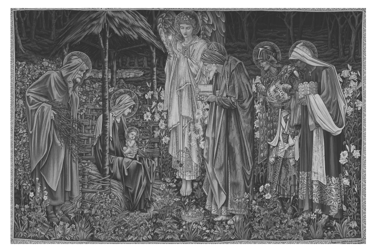
Adoration of the Magi, tapestry Edward Burne-Jones, 1904