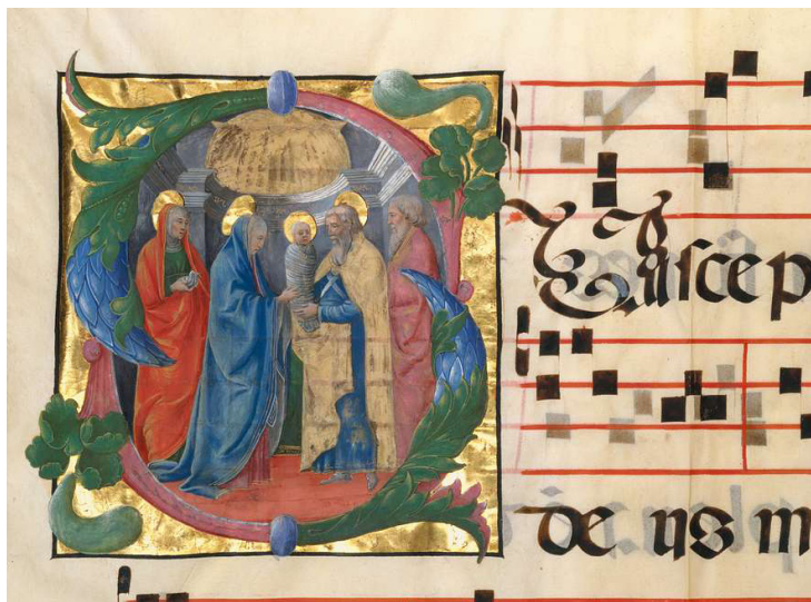
Presentation in the Temple, detail manuscript illumination Cosme Tura, (c. 1430-1495)