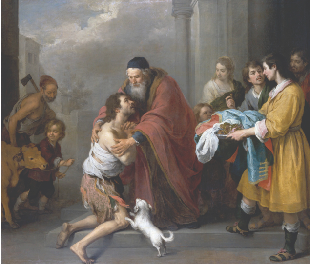
The Return of the Prodigal Son (c. 1667-1670) Bartolomé Esteban Murillo