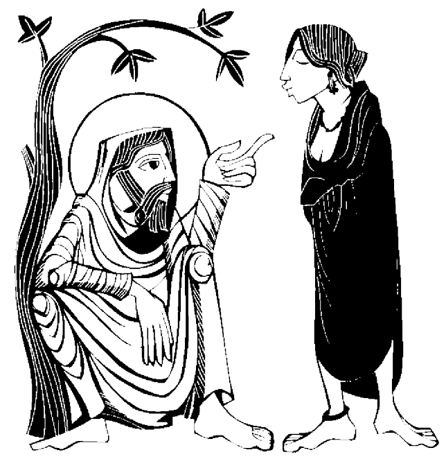
"Go, and from now on do not sin any more." cf. John 8:11