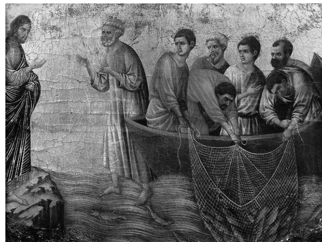
Jesus Appears on Lake Tiberias, Duccio di Buoninsegna 1308-1311