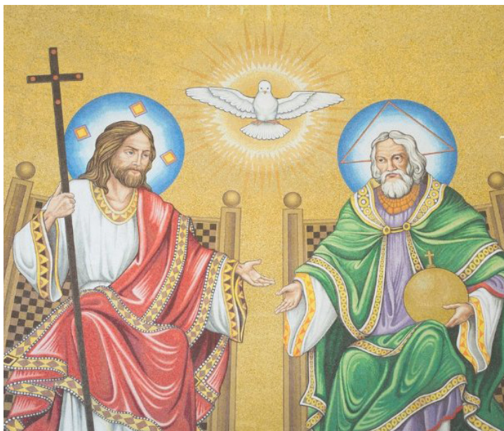
Holy Trinity , mosaic Basilica of the National Shrine of the Immaculate Conception, Washington, DC