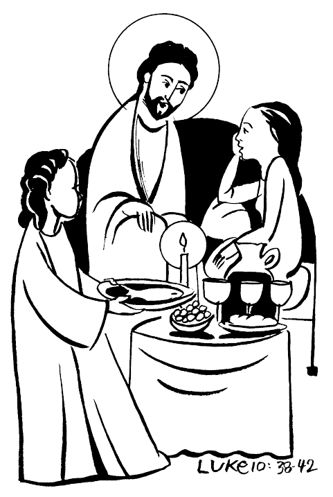
"There is need of only one thing." Luke 10:42a