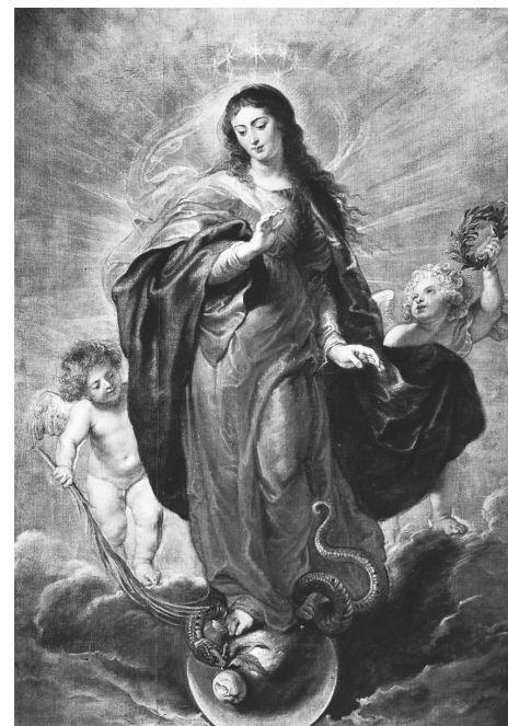
The Immaculate Conception (c. 1628) Peter Paul Rubens (1577-1640)